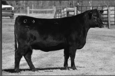
A6010 | G A R 100X x G A R Destination 1022 Aled to GAR Proactive