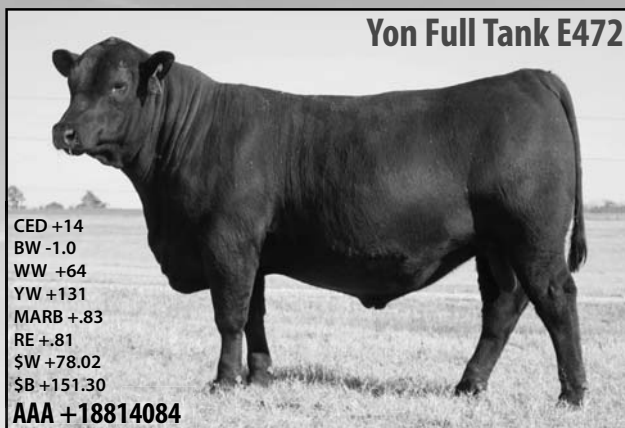
Yon Full Tank E472

CED +14 BW -1.0 WW +64 YW +131 MARB +.83 RE +.81 $W +78.02 $B +151.30