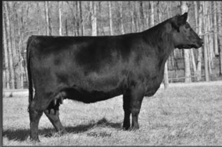
6155 | Basin Payweight x Objective 7125 Aled to EXAR Stud

383 Stoney Point Road. | Bowdon, GA 30108