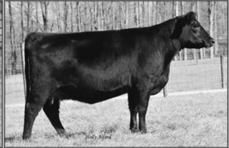
6162 | Basin Payweight x TC Touchdown Aled to EXAR Stud