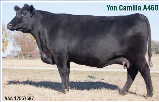
Yon Camilla A460

Select offering of SimAngus & Ultrablacks