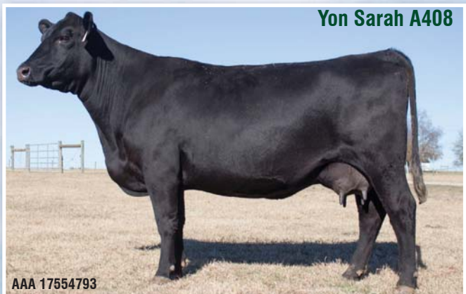
Yon Sarah A408

Four-year-old donor prospect has a top 20% or better EPD ranking for $B, $W, RE, RADG, Docility, SC, WW and YW. Sells with a November Heifer calf by Connealy Comrade.