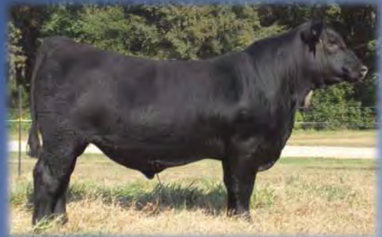
Full and half brother Momentum sons like this will sell.

Bramblett Angus is the place to be on December 7, 2013 if you need more muscle expression, larger hips, square hips, deep bodied, structurally correct sire prospects that will add both pounds and balance.