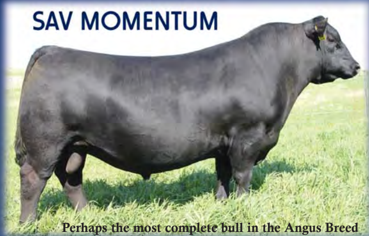
Perhaps the most complete bull in the Angus Breed

This year In Barry Cronic's commercial herd 50 Momentum sired calves had an average wean weight of 70 pounds more than other sire groups. 70 lbs x $1.50 per calf equals $105.00 per calf increase in profit. Cronic is retaining all the heifers from this group.