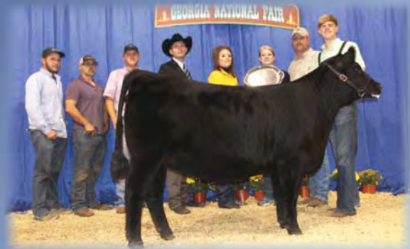
This October 2012 daughter of Momentum, bred in the Elrod & Tolbert program, was recently crowned 2013 Georgia National Fair Champion Overall Heifer.

76 commercial Angus open heifers, bred heifers, and first calf pairs, and 10 registered Angus females will sell!