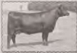
Davis Hita 4001

The $15,000 top seller in the 2009 SC Futurity and foundation Rita female for Bramblett Angus a daughter by SAV Net Worth Selts!