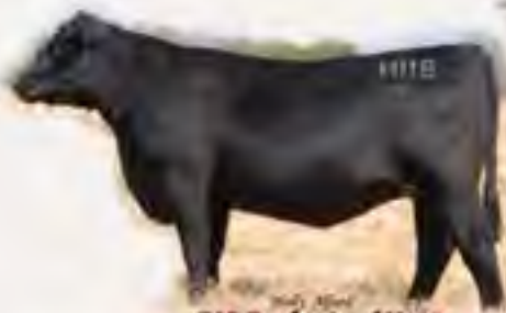
GAR Predestined H118