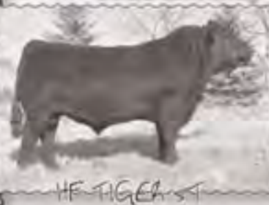
HF TIGER ST

The only female ever to be a two-time Canadian Western Agribition Supreme Champion. Her natural heifer calf recently sold one-half interest to Warner Angus for a $100,000 valuation.