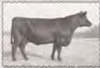
Cedar Creek 220 Hita 2510

This reigning World Angus Forum and Canadian Western Agribition Grand Champion Bull by HF Kodiak SR who also sired the 2010 National Western Grand Champion Pen of Bulls is the sire of this elite pregnancy.