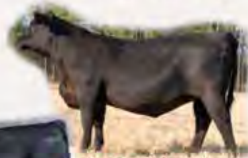
Ogeechee Blackcap 8112