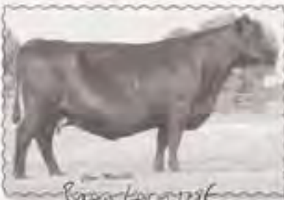
Rasin Lucy 178E

The $22,000 KramichLink donor by Papa Equator 2520 and the feed efficiency queen Ideal 4405 of 6007 4296 will offer an OCC Emstaxon 854F heifer calf.