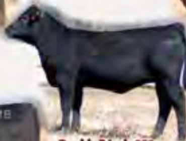
Double B Lady 392