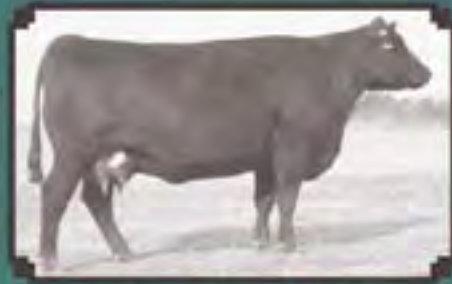
YON Quon S70

BW 1075 WW 1480 MEH 4600 42 +4.3 +48 +28 +20 +22 +30 Sire: YON Burgess R323 Dam: YON Burgess R323 2009 S. C. Angus Assoc. Futurity 2009 S. C. Angus Assoc. Futurity 2009 S. C. Angus Assoc. Futurity