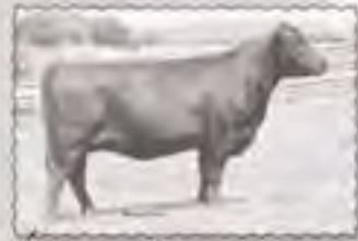
Sulclant Lacy 3410-4405

The $100,000 valued one-time Britt donor offers her very best SS Objective T510 D176 daughter ever.