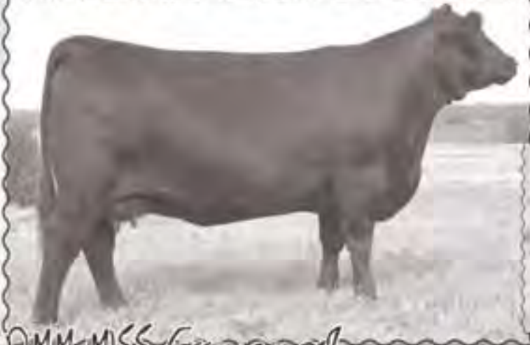
PMM-MISS Essence 21H

The only female ever to be a two-time Canadian Western Agribition Supreme Champion. Her natural heifer calf recently sold one-half interest to Warner Angus for a $100,000 valuation.