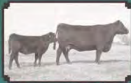
YON Burgess R323 [NHF]

BW 1075 WW 1480 MEH 4600 42 +4.3 +48 +28 +20 +22 +30 Sire: Yon Blackcap R105 Dam: YON Blackcap R105 2009 S. C. Angus Assoc. Futurity 2009 S. C. Angus Assoc. Futurity 2009 S. C. Angus Assoc. Futurity