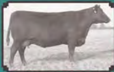
YON Witch S513

BW 1075 WW 1480 MEH 4600 42 +4.3 +48 +28 +20 +22 +30 Sire: YON Witch S508 Dam: YON Witch S508 2009 S. C. Angus Assoc. Futurity 2009 S. C. Angus Assoc. Futurity 2009 S. C. Angus Assoc. Futurity