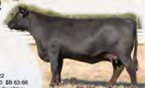
Murcellago Erica 7242