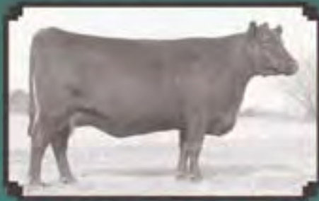
YON Blackcap R105

Held at the T. Ed Garrison Livestock Arena • Clemson University, Clemson, SC