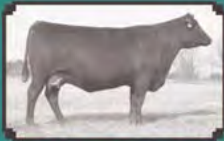
YON Witch S508

BW 1075 WW 1480 MEH 4600 42 +4.3 +48 +28 +20 +22 +30 Sire: YON Quon S70 Dam: YON Quon S70 2009 S. C. Angus Assoc. Futurity 2009 S. C. Angus Assoc. Futurity 2009 S. C. Angus Assoc. Futurity