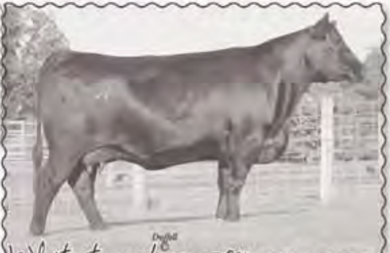
Whitestone Lucy 7014

The $410,000 breed leader is the grandmother of a confirmed heifer calf pregnancy.