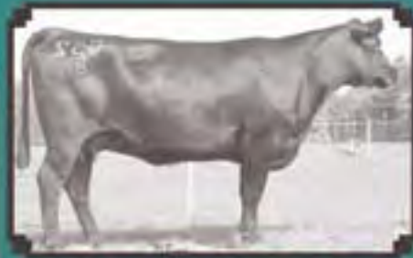
GAR 616 Rito G52

BW 1075 WW 1480 MEH 4600 42 +4.3 +48 +28 +20 +22 +30 Sire: YON Witch S513 Dam: YON Witch S513 2009 S. C. Angus Assoc. Futurity 2009 S. C. Angus Assoc. Futurity 2009 S. C. Angus Assoc. Futurity