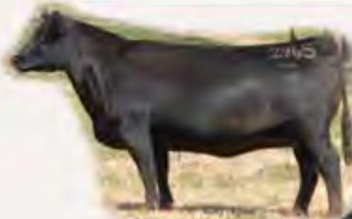
GAR Retail Product 2965